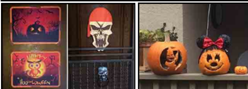
Property Listing (as of 7 November 2014) Active Listings

This type of metal pipe installation that broke is no